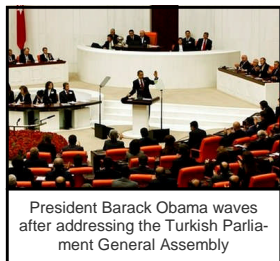
President Barack Obama waves after addressing the Turkish Parliament General Assembly

Obama reiterated the US commitment to previous understandings, including the process launched at Annapolis in 2007, promoting a peace agreement between Israel and its neighbors.