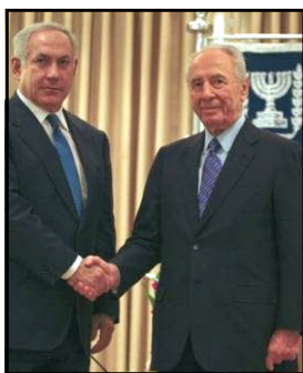
Benjamin Netanyahu accepts congratulations from President Shimon Peres

After the failure of his last-ditch effort to muster Kadima leader Tzipi Livni's support for a unity government, President Shimon Peres formally entrusted Likud chairman Benjamin ("Bibi") Netanyahu with the task of building a national coalition government. The right-wing Netanyahu was given 42 days to put together a coalition that might draw on Labor and Kadima, though he also spoke favorably of including the ultranationalist Yisrael Beiteinu party, which made substantial gains in the national election.