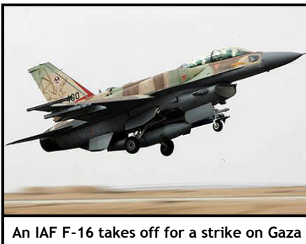
An IAF F-16 takes off for a strike on Gaza

Co-sponsor and Senate Minority Leader Mitch McConnell said, "The Israelis ... are responding exactly the same way we would." The vote expressed an "unwavering" commitment to Israel's welfare and recognized its right to act in self defense to protect citizens against acts of terrorism.