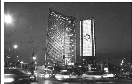
Buildings in Tel Aviv illuminated to celebrate Israel's 60th anniversary

150 foreign paratroopers, from various armies around the world, came to Israel to take part in the celebrations and to salute the IDF. Representing the US, England, France, Spain, Ger-