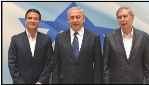
Prime Minister Benjamin Netanyahu (center) with outgoing Mossad director Tamir Pardo (right) and incoming director Yossi Cohen, at a ceremony for the newly appointed Mossad head, in Tel Aviv, on January 6, 2016.

During the congressional review of the Iran nuclear deal, President Obama promised Democratic lawmakers he would respond forcefully to Iranian malfeasance and would swiftly impose sanctions for non-nuclear issues outside of the JCPOA—including ballistic missile activity. [JewishJournal]